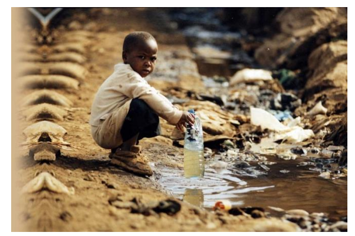
Figure 2: A Resident Drinking Water from a Rainwater Puddle in Africa

This is especially true in healthcare settings, where patients and staff are at additional risk of infection and illness when there is a lack of water, sanitation, and hygiene services (ACT, 2021).