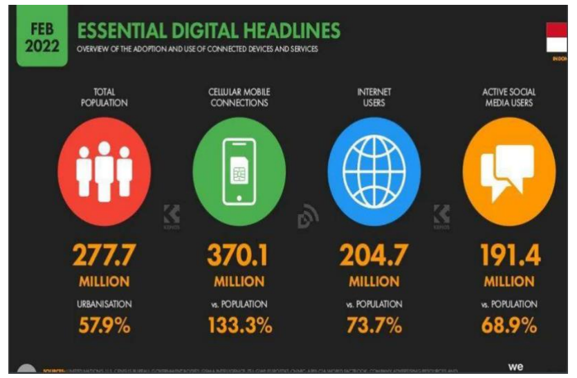
Figure 3: Internet and social media user data in Indonesia

internet and 3 hours per day on social media. Popular applications include WhatsApp, Instagram, Facebook, TikTok, and YouTube. These statistics highlight the potential threats posed by the advancement of information and communication technology and the use of social media to the security and public order of Indonesian society. It is crucial to adopt an integrated and comprehensive approach to proactively address these challenges.