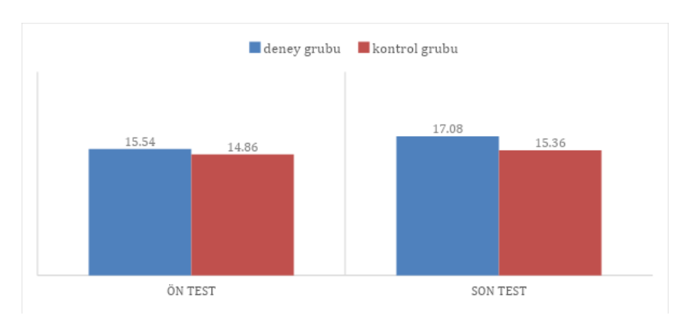
Figure 1: Experimental and control group academic achievement test pre-test and post-test chart Note. Experimental group, Control group

When the graph is examined, it can be seen that the academic achievement post-test scores of the experimental group students are higher than the pre-test scores, and the academic achievement post-test scores of the control group students are close to the pre-test scores.