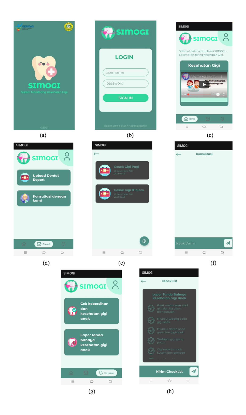
Figure 4: SIMOGI Application for Parents Handling Children at Home (a) Homepage (b) Login page (c) Dental Hygiene Video (d) Consult Menu (e) Dental Report (f) Consult menu with chat (g) Reminder menu (h) Checklist menu of dental health danger