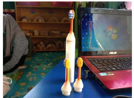
Figure 2: TOMON Smart Tooth Brush

Figure 2 is the realization of a smart toothbrush that will be used in the implementation. The toothbrush is adjusted to the needs, namely by installing a bluetooth module, arduino nano and an IMU sensor in the toothbrush handle. The bluetooth module aims to enable the toothbrush to be connected to the TOMON game wirelessly. The IMU (Inertia Measurement Unit) sensor is a sensor that detects the movement of the toothbrush. Arduino nano is a microcontroller that regulates the work of bluetooth and IMU sensors. The handle of the toothbrush is shaped through a 3D Printer with PLA (Polylactic Acid) 3D Printer filament as raw material.