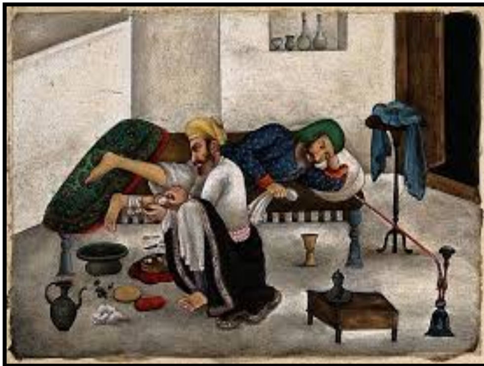
Figure 2. Preparing medicines.

Scope of Ayurveda: The wide scope of Ayurveda, in general, covers (i) relationship between matter and life; (ii) biological theories concerning: (a) embryonic conception, (b) body, life, and soul, and (c) rules of genetics; (iii) physiological and pathological theories; (iv) food; (v) rules of health and longevity; (vi) diseases, their diagnosis and treatment; (vii) poisons and antidotes; and (viii) ethics.