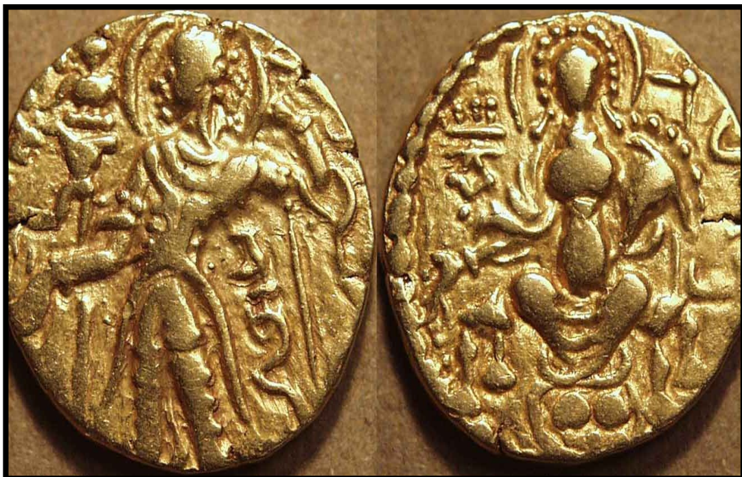
Figure 3. Old coins.

During the first century AD, there was a mass production of metals like gold, copper, iron, silver and of alloys like bronze and brass. One of the most famous iron pillar in the Qutub Minar complex is indicative of the rich quality of alloying that was being done. Acids and alkalis were being produced in large quantities and utilized for many purposes, mainly in medicines. This technology was also greatly used for other crafts like producing colors and dyes. The most popular dyeing technology was textile dyeing. The Ajanta frescoes reflect on the quality of color [10].