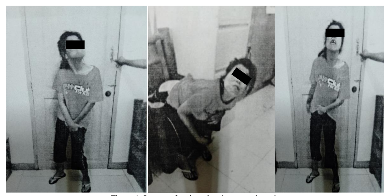
Figure 1: Images of patient showing truncal ataxia.

Pertinent physical examination findings showed her eyes looking into different directions, atrophic changes in both arms and feet, and hypotonia. Neurological examination showed ptosis of the left eye, truncal ataxia, severe dysarthria, and global hyperreflexia (Fig.1). There was absence of retinal anomalies or degeneration on ophthalmologic examination. In her psychiatric evaluation, she was deemed to have lack of appropriate awareness to surrounding environmental changes. She is able to follow simple commands such as "raise your hands" and to identify body parts by pointing to it, and was able to communicate by answering yes or no. She can identify the numbers 1 to 4 by answering through fingers. During the entire consultation her communication was done with the assistance of her mother. She was notably stuttering and severely dysarthric with one syllable only. The patient showed abnormal gait, had major difficulty in walking that of the appearance of a staggering-like gait disorder. She could not perform her own personal care activities, such as independent bathing and dressing.