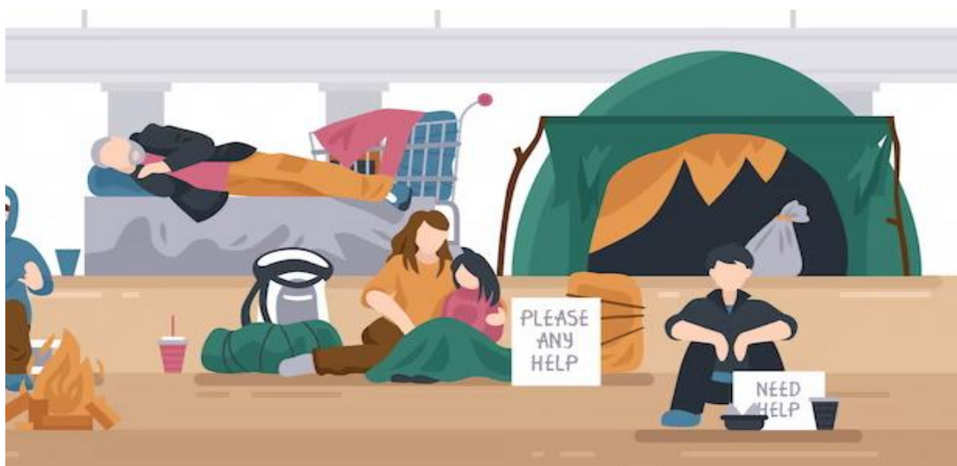
Figure 3: Homeless people horizontal background Free Vector. (2019, September 4).

A swath of homeless individuals resting with their things in plastic bags or shopping carts can be seen against a horizontal backdrop in the picture. The photograph depicts the harsh reality of homelessness, in which people or families lack stable homes and are forced to live on the streets while dealing with financial hardship, mental illness, or substance abuse. The figure below, however, may also be seen as a rallying cry and a potential answer to the issue of homelessness. The graphic depicts the need for social services, support programs, and affordable homes for the homeless. Providing access to food, clothes, and sanitary services would help alleviate the hardships shown in the images of individuals pushing bags and carts. In a nutshell, the number might serve as a reminder of the gravity of homelessness and the need of finding systemic solutions to the problems that have led to it. It has the potential to motivate people and groups to assist those in need by engaging in voluntary work or financially supporting the causes they believe in.