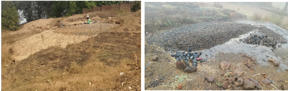
Figure 5. Crushed rock aggregate sizes (6", 1" to ½ inch)