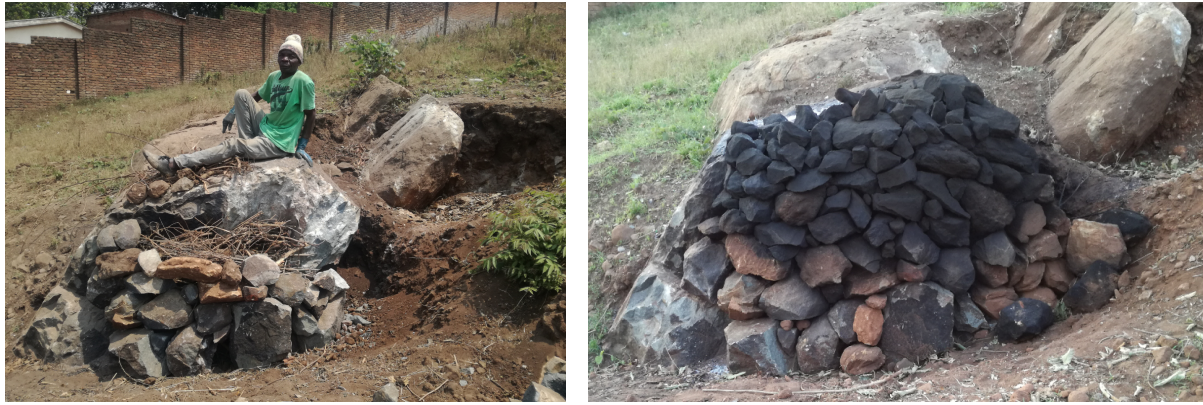
Figure 4. Excavation and heating procedure (Left: unburnt; Right: burnt)