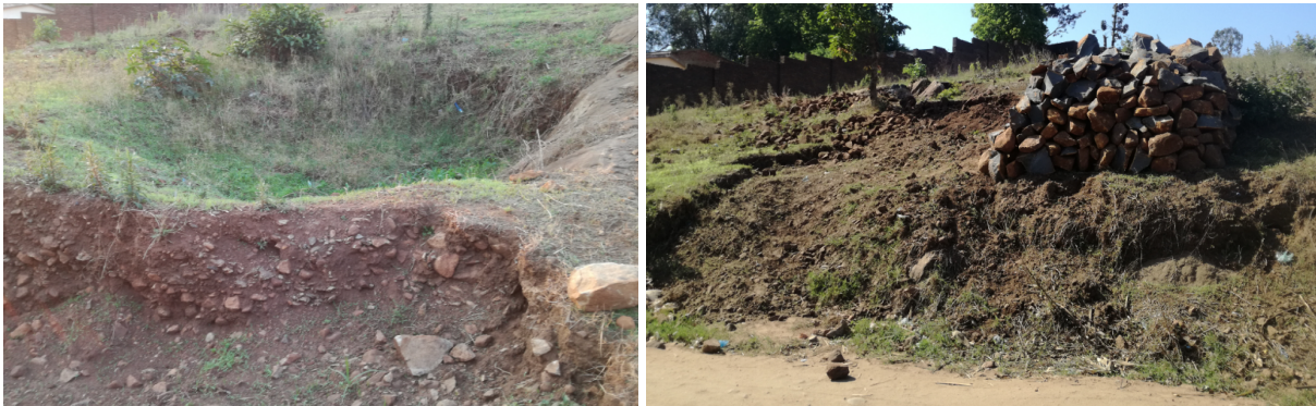
Figure 6. Pits left behind by ASM