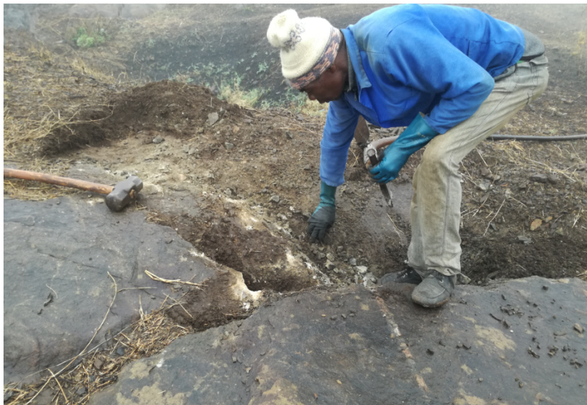
Figure 3. Artisanal quarry mining tools (14 lb sledge hammer, chisel, hoe and crowbar)