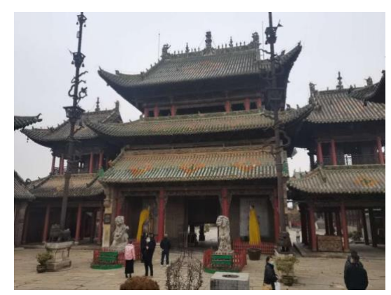
Figure 2: Sheqi County, Henan Province, the birthplace of Yuediao opera