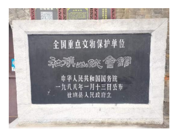
Figure 3: Sheqi County, Henan Province, the birthplace of Yuediao opera