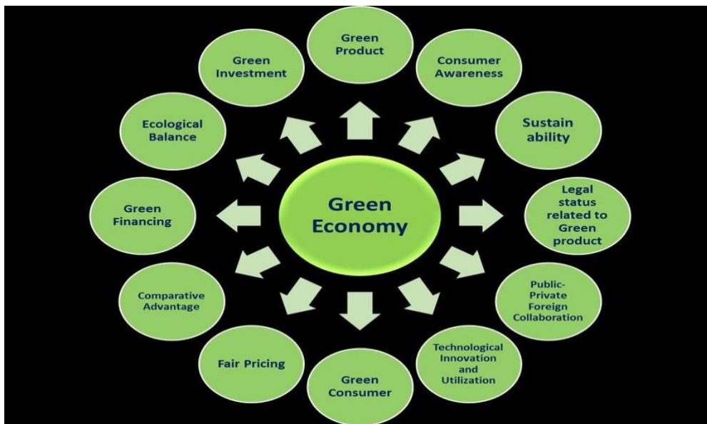
Figure 3: Green economy and linkage with various factors

GE considers the value of natural assets of the environment in planning and decision-making. Economic growth can reduce poverty in low-income countries. The standard of working with the societies of green economy traditional environmental management lay stress on the pollution taxes and high fees. The fear of making or spreading more pollution costly more incentives for new green jobs technologies, opportunities, and investments (IBRD Funding Program; Green Bonds, 2022). Figure 3 shows the relationship of the green economy with various factors like green investment, sustainability, green consumer, green financing, ecological balance, etc.