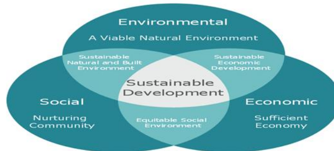
Figure 4: Integrated policy cycle for three pillars of sustainability