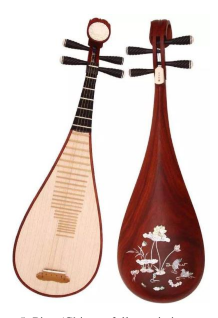
Figure 5: Pipa (Chinese folk music instruments)