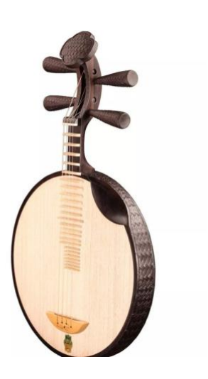
Figure 6: Zhongruan (Chinese folk music instruments)