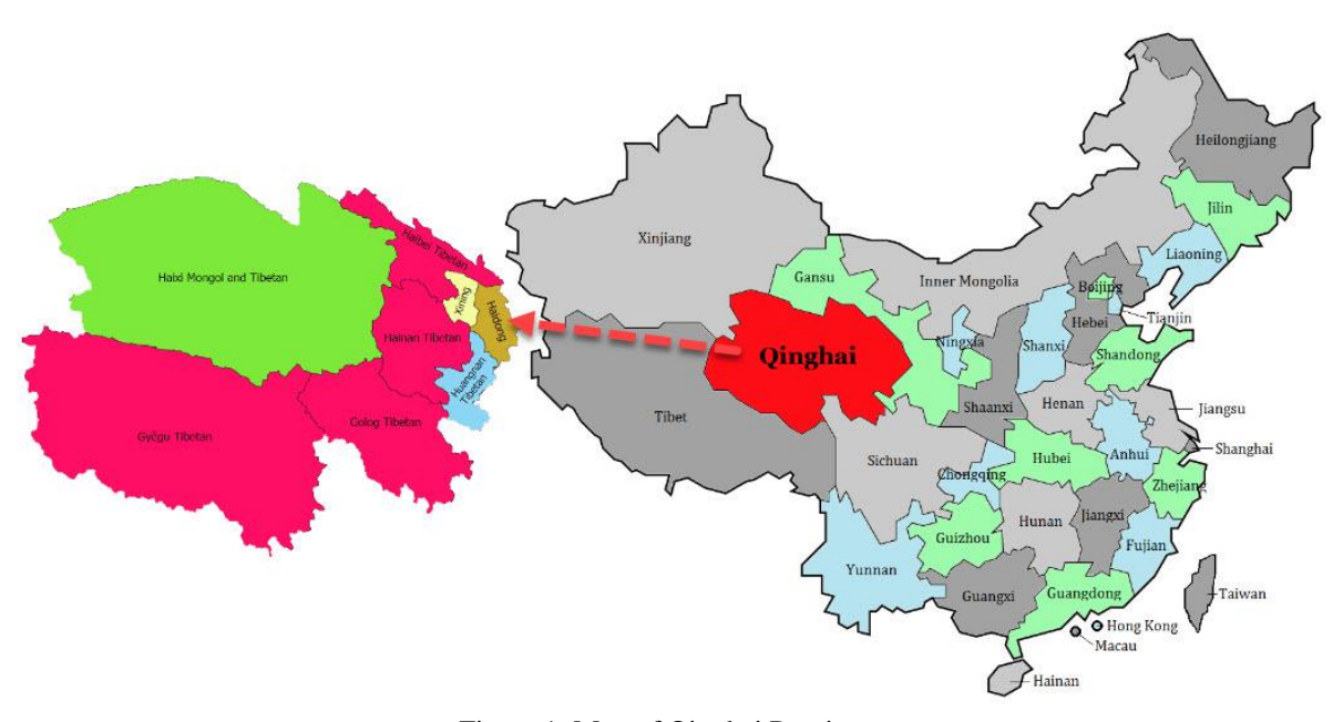
Figure 1: Map of Qinghai Province