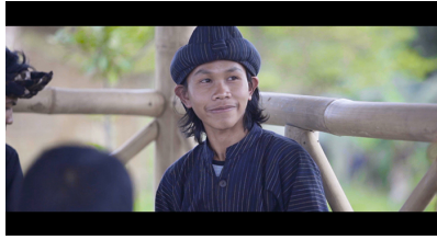
Figure 1: Scene 17