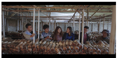
Figure 3: Scene 25