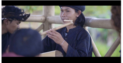
Figure 2 : Scene 23