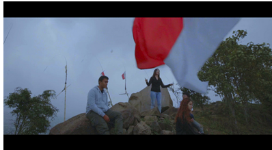
Figure 4: Scene 26